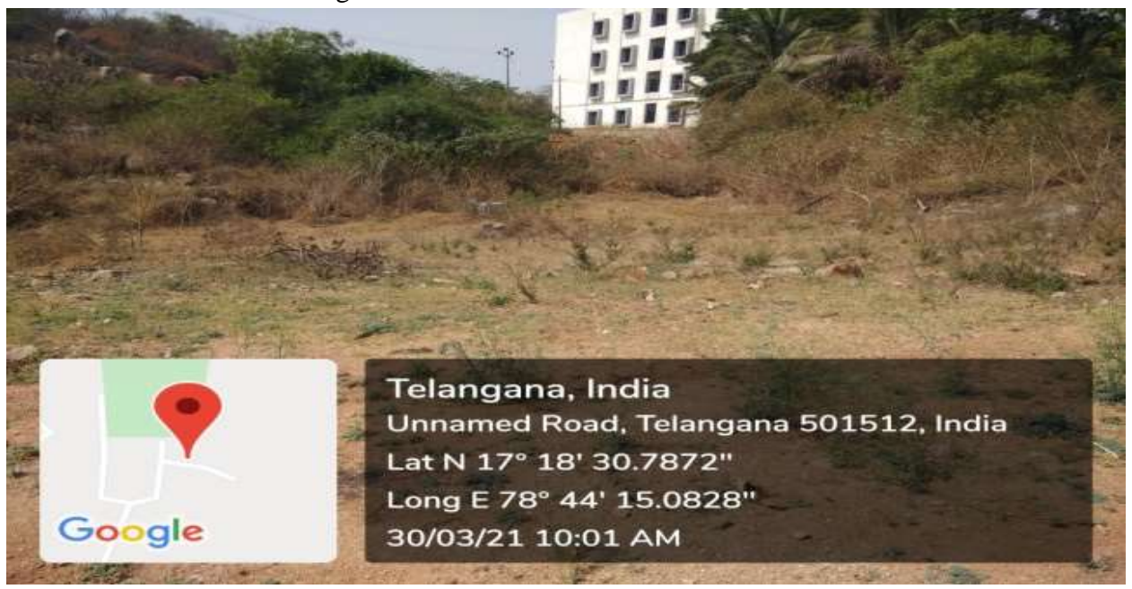
Rain harvesting pit