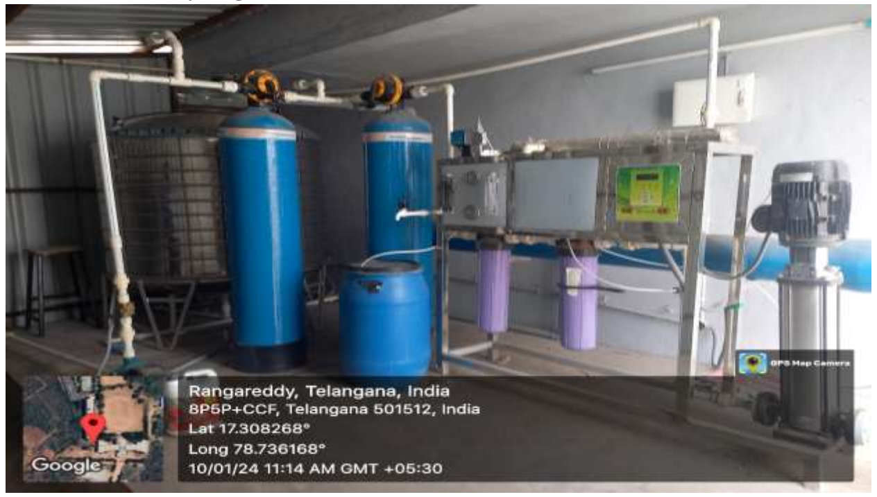
RO plant in Campus