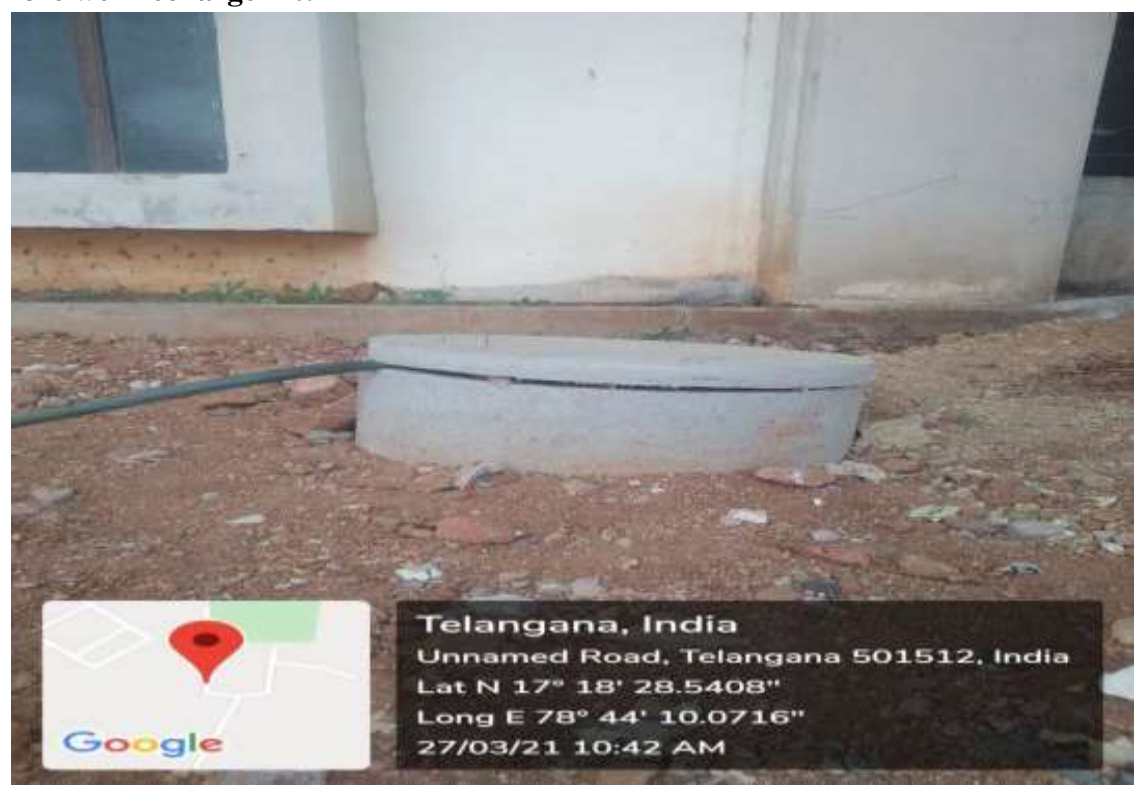
Over Head Rain water storage tank