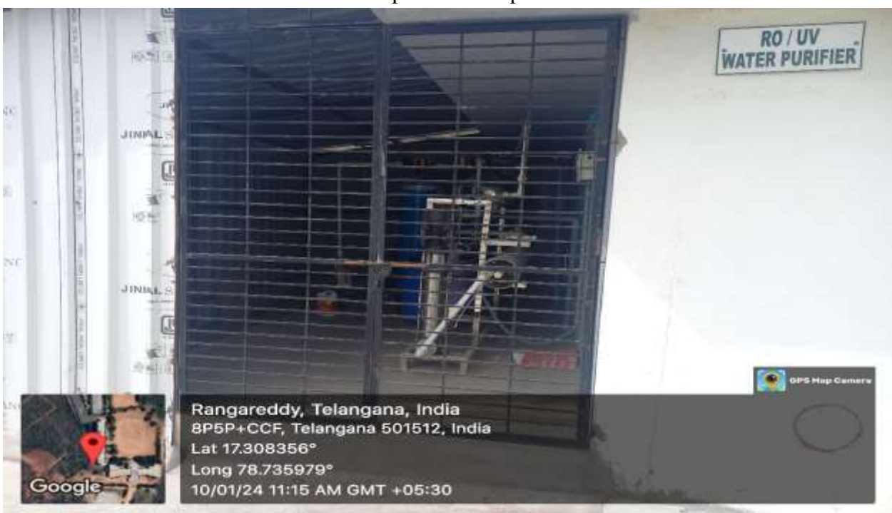
RO plant in Campus

PRINCIPAL Technology & Sciences Pigliour (V), Belowingerism (Post) Insurant (M), R.A. Dist. HYD. 50* 823