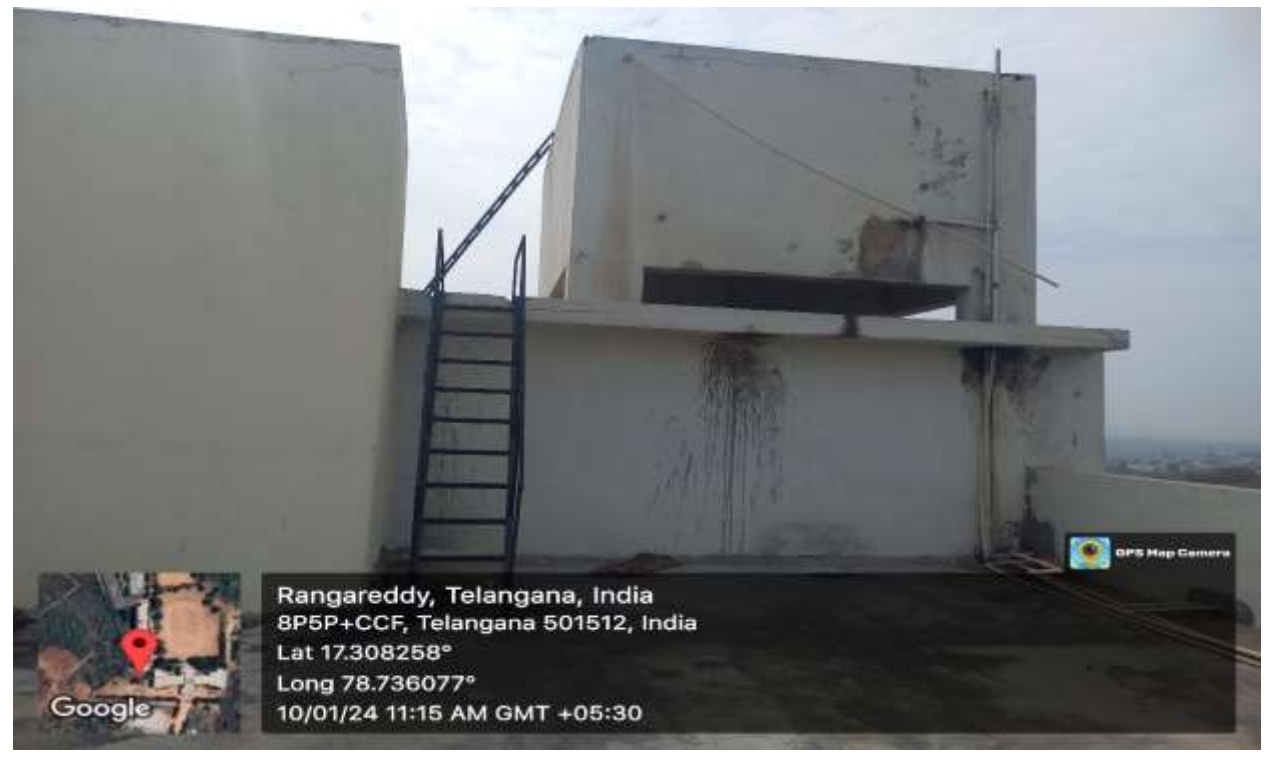
Overhead tank at AITH (B-Block)

PRINCIPAL Annamectarys institute of Technology & Sciences Plafour (V), Belowingerson (Post) illapourme (M), R.R. Dist. HYD-50* 525