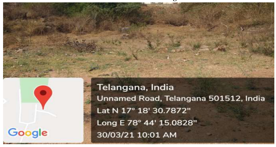
Bore well recharge pit (Mini Dam)

PRINCHAL Annamecharya Institute of Technology & Sciences Philippor (V), Balaningerism (Post) Abdullapormit (R), R.R. Dist. HVD-50* 523