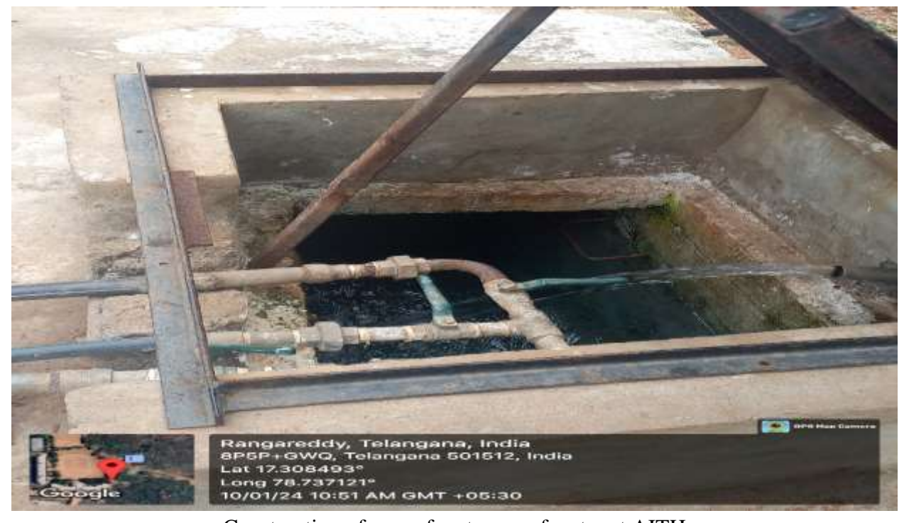
Construction of sump for storage of water at AITH